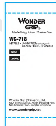
Reference standard :