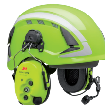
MT15H7P3EWS6 / MT15H7P3EWS6-111