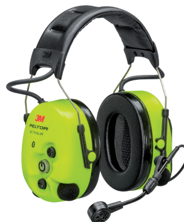
MT15H7AWS6 / MT15H7AWS6-111